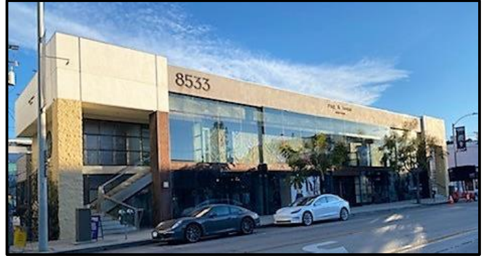
Rag & Bone